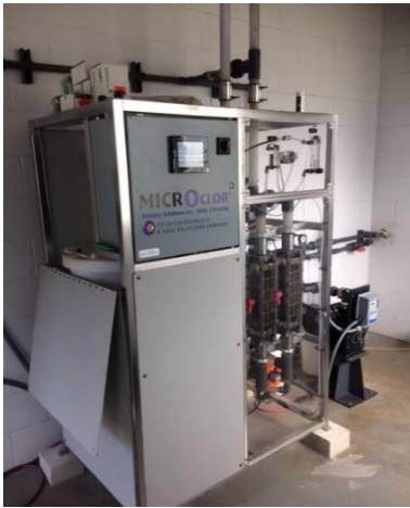
Aqua Engineers Aqua Puhi Site with 40 pound per day (PPD) Microclor® OSHG unit

the system with a dilute muriatic acid (“pool acid”) when a build-up can be observed on the cells by viewing through the transparent cell housings. This cleaning routine may occur as frequently as once per quarter to once per year depending on the quality of salt and softened water.